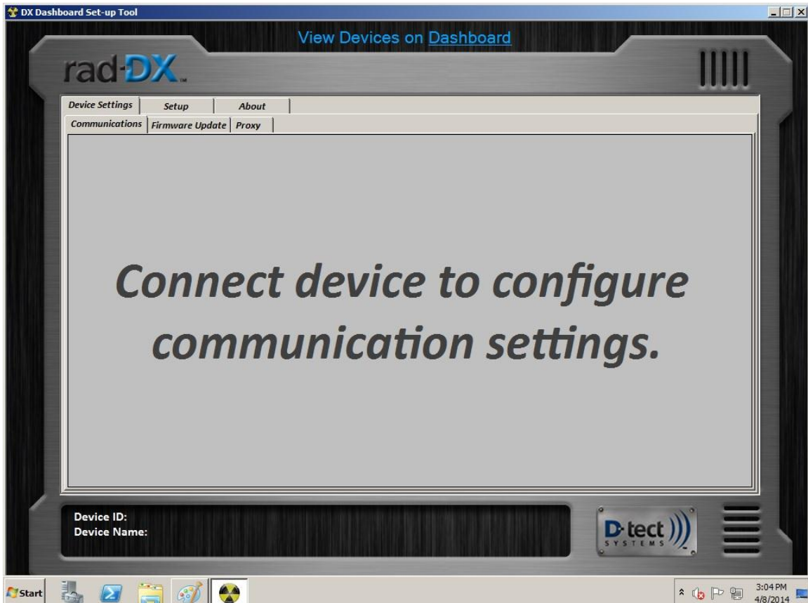
Figure 2: DX-Dashboard Setup Tool Home Screen