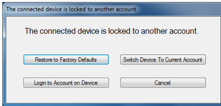
Figure 3: Locked Device Options Screen