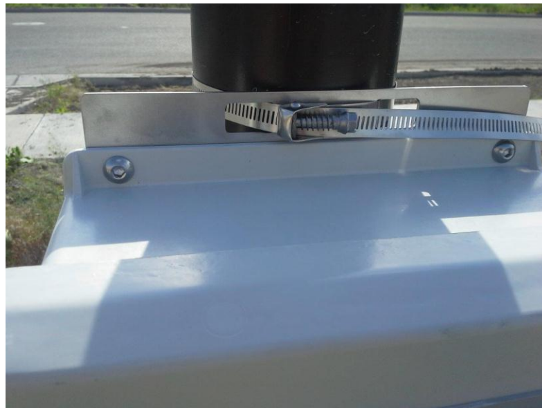
Figure 4 - Close Up of Metal Strapping